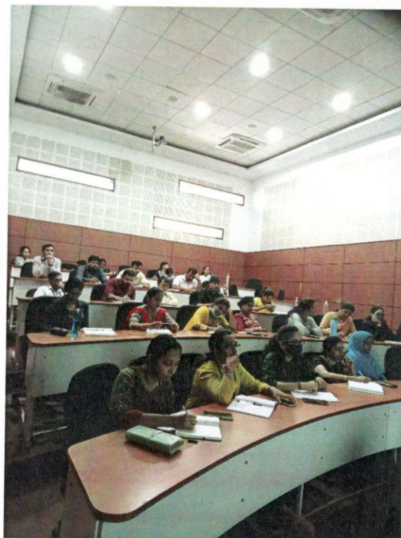
Staff Members Participated