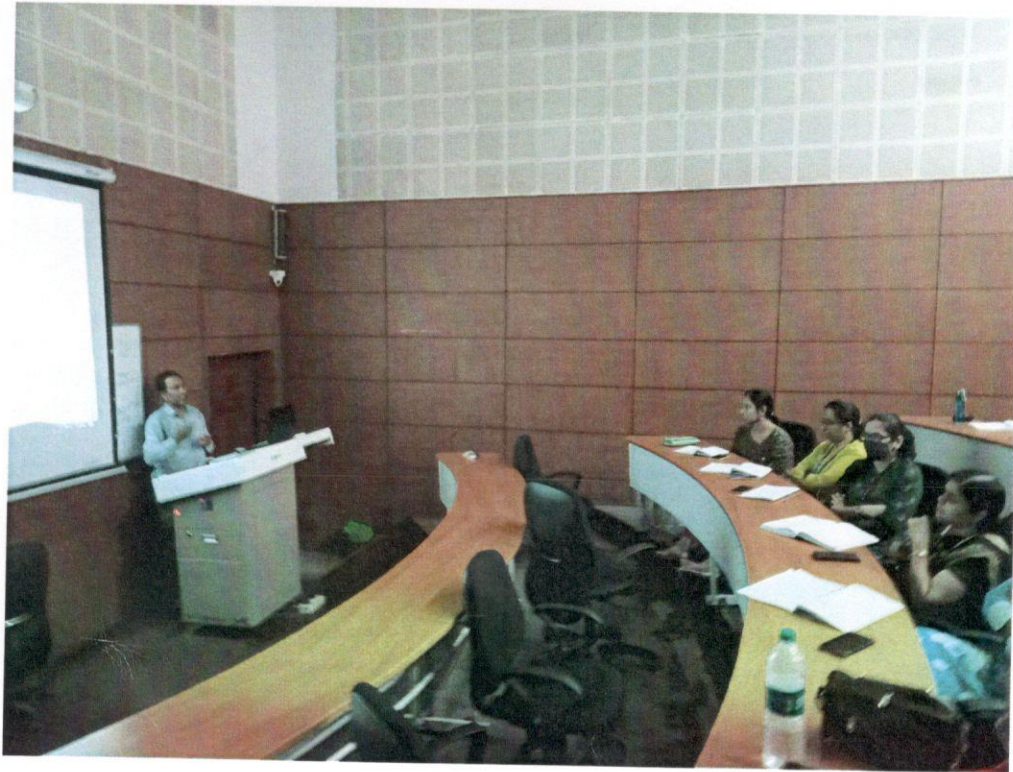
Staff Members Participated